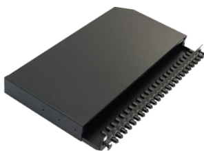
A. Sliding drawer design

The Excel range of ST patch panels are sliding drawer 'tray style' housings suitable for either direct termination or splicing of upto 24 fibres in 1U of rack space. Each panel is manufactured from high quality 2mm thick steel and finished in Black powder coated paint to provide a strong and durable unit. To the front of the patch panel the specified number of simplex adaptors are loaded from left to right. The fascia also houses the release latches for the sliding drawer. Each adaptor is fitted with a colour coded dust cap, Black for multimode, Red for singlemode. Each simplex adaptor accommodates one terminated fibre. Each panel has included within it a set of adjustable fixing arms, and a cable management pack which includes cable entry glands, cable ties, and a 24 way splice bridge.