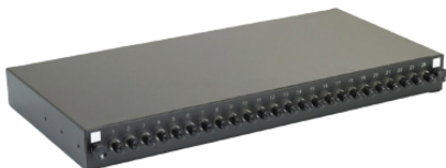
B. Panels are available part or fully loaded