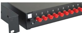
C. Adjustable fixing arms. clear port and panel labelling